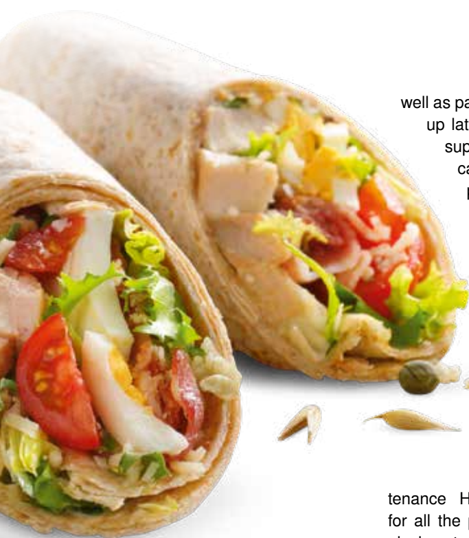
For its diverse selection of wraps, QiZiNi uses only the best, freshest ingredients.

In the food industry, it is absolutely vital that compressed air meets the highest standards of quality and purity.