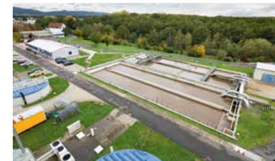
An aerial view of the facility at Lachen-Speyerdorf.

rate 1307 scfm) machines, also each with frequency converter. One of the two larger units is sufficient to cover the necessary redundancy to ensure that the compressed air supply can still be covered in full when it comes to maintenance or repair work, or