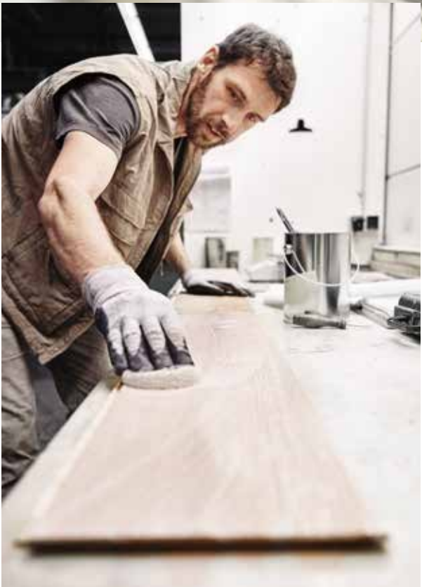
For their surface finishes, ter Hürne uses finishing oil derived from linseed and walnut.

When it came to designing a new compressed air system capable of providing a round-the-clock supply of quality compressed air to all of the various applications, the project team – under Thomas Brüning and Ferdinand Kremer – made the natural choice and consulted KAESER. This resulted in purchasing two speed-controlled type CSD 105 SFC and two CSDX 140 rotary screw compressors to supply compressed air at 95 psi. This new generation of CSD/CSDX machines features a perfectly matched reluctance motor and