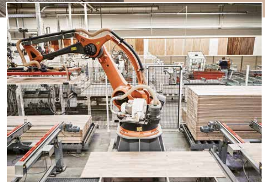
Numerous machines throughout the production process rely on compressed air.

ophy pervades the entire business, from the quality of the end product to the employees' working environment, the production systems and the processes themselves. And it so happens that when a modern manufacturing operation decides to overhaul its processes and systems, the spotlight shines inevitably on its compressed air supply. In the case of ter Hürne, an initial energy review highlighted potential savings that were nothing short of enormous. The entire company was using 4.5 million kWh per year of power, which was approximately equivalent to the combined electricity consumption of 1000 four-person households. The compressed air supply alone