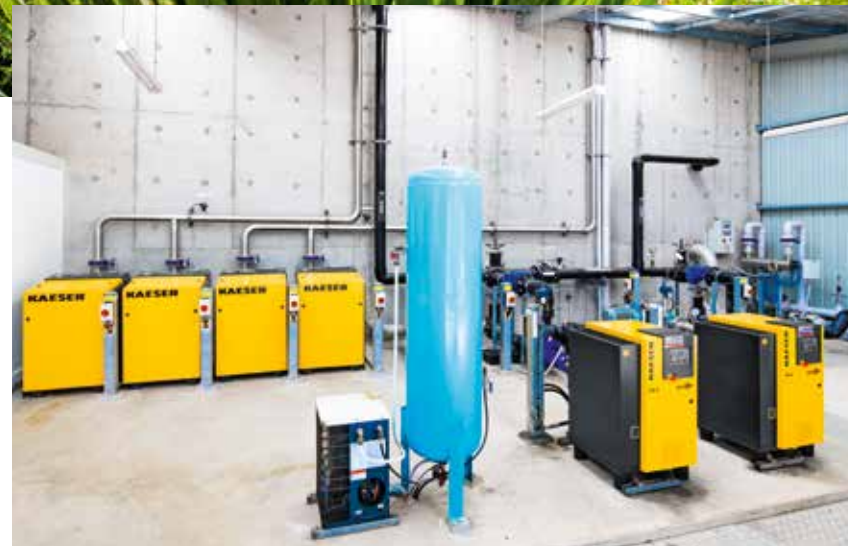
Four COMPACT-series rotary lobe blowers from KAESER are used to deliver process air for the membrane bioreactor.

The innovative solution from Permeate Partners was to use treated wastewater for the purposes of irrigation.