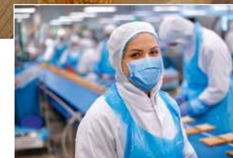
The production of sandwiches, paninis and wraps is principally a manual process and is difficult to automate.