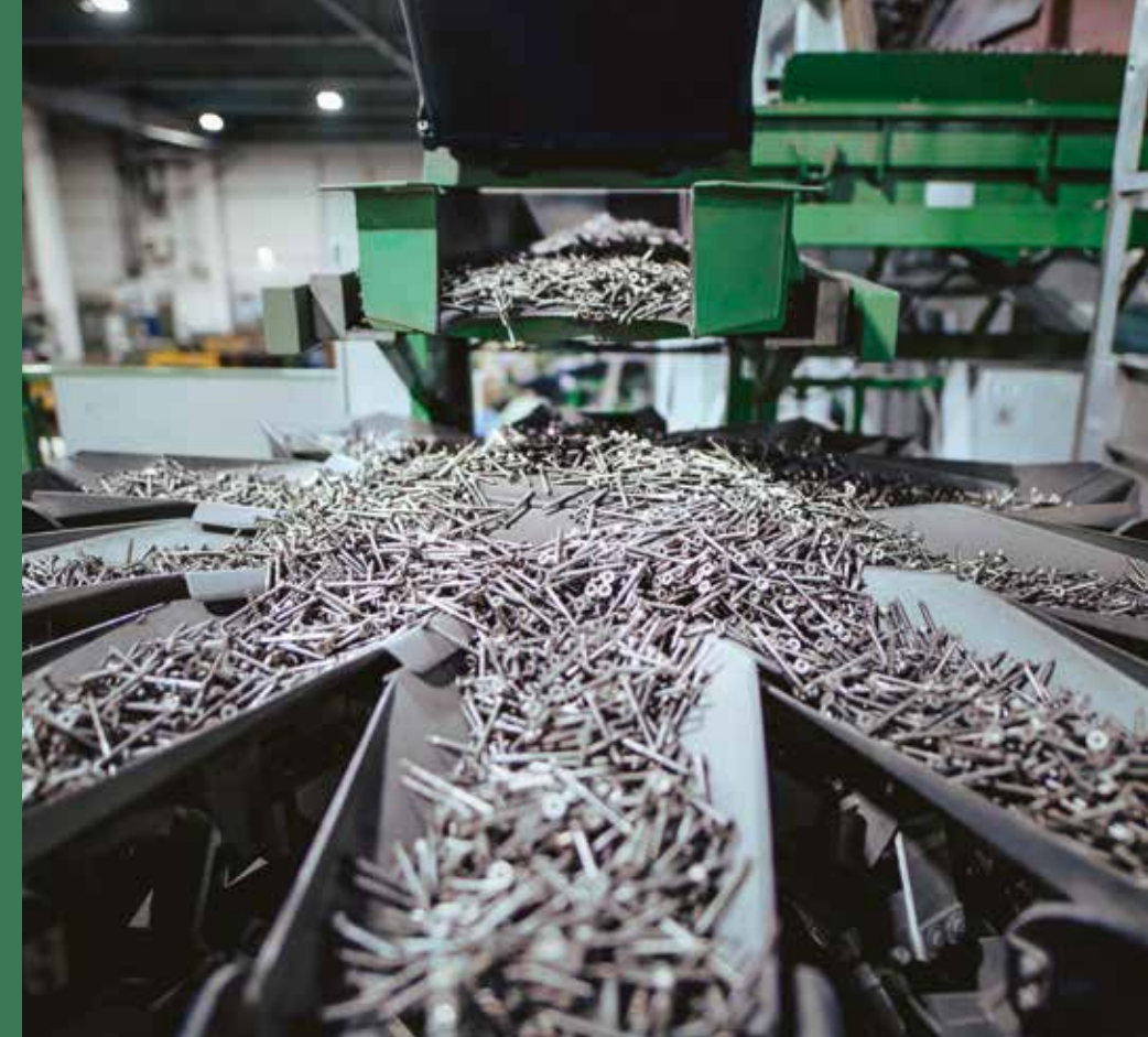
Based in Ennepetal, the company produces up to 50 million screws per day.

The next highest level of air demand comes from the rolling area (30%), where the threads are worked into the blanks. This is achieved by the movement of rollers across the length of the screw. In this section, compressed air is used as control air for the vibrating conveyors, which serve to ensure that a continuous stream of blanks