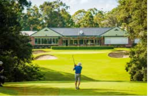
Rich in tradition, the Pennant Hills Golf Club was founded in the 1920s.

Set among the picturesque green hills of Beecroft in the Australian state of New South Wales, the Pennant Hills Golf Club is the fourth oldest golf club in the area. Founded in 1923, it still occupies its original location in the Hills Shire district to the northwest of Sydney. Over recent years, a lengthy period of drought caused by persistently high temperatures and strong winds across the whole of southern Australia has turned the upkeep of its green areas into one of the greatest challenges facing the club today.