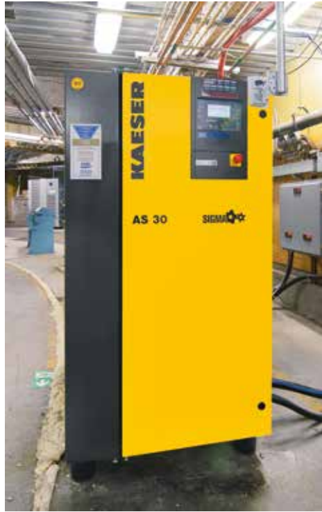
The KAESER AS 30 rotary screw compressor must meet highly specific requirements at an altitude of 14,000 feet.

The telescope’s primary mirror, made of solid, thermally stable glass and weighing in at 25,000 lbs, features 24 flat pistons, each about 12 inches in diameter and two inches thick. These pistons are powered using compressed air, which must be exceptionally clean and dry at a very precise pressure. “The pressure required to support the pistons on this equatorial telescope must be controlled by a unique passive regulation system to within 0.01 psi over