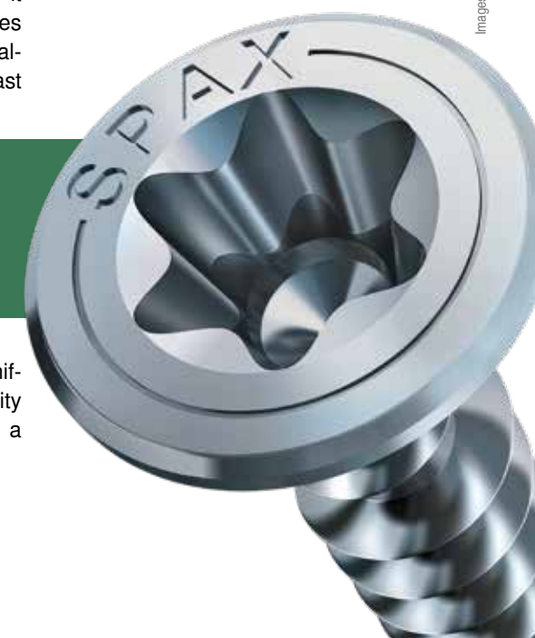
The SPAX screw with its distinctive cruciform drive.

Of particular pride to the customer, the KAESER air system boasts an exceptionally low idling rate of just 1.8%.