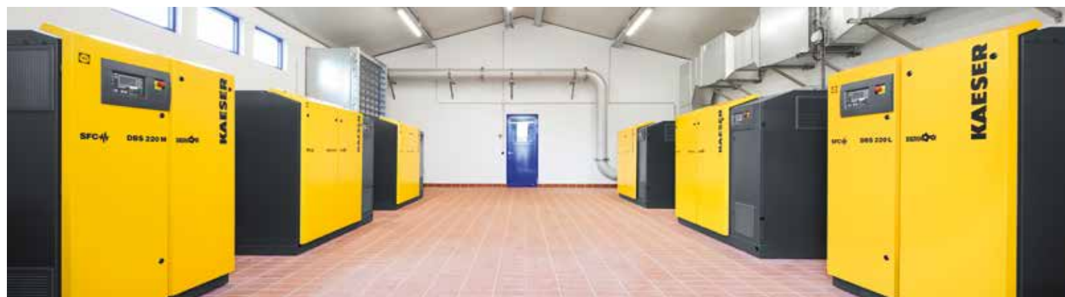
The blower system at the Lachen-Speyerdorf wastewater treatment plant, with its high-efficiency rotary screw blowers from KAESER KOMPRESSOREN.

in cases of fluctuating air demand (such as occur during the grape harvest). This new, state-of-the-art blower system easily fulfills all the technical prerequisites necessary to guarantee peace of mind for the operators at the Lachen-Speyerdorf treatment plant – even at the height of the winemaking season!