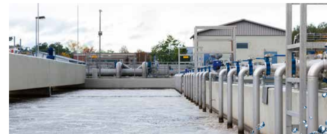
The refurbished aeration tanks.