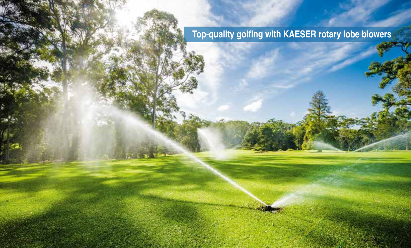
The well-tended greens are the flagship feature of the Pennant Hills Golf Club.