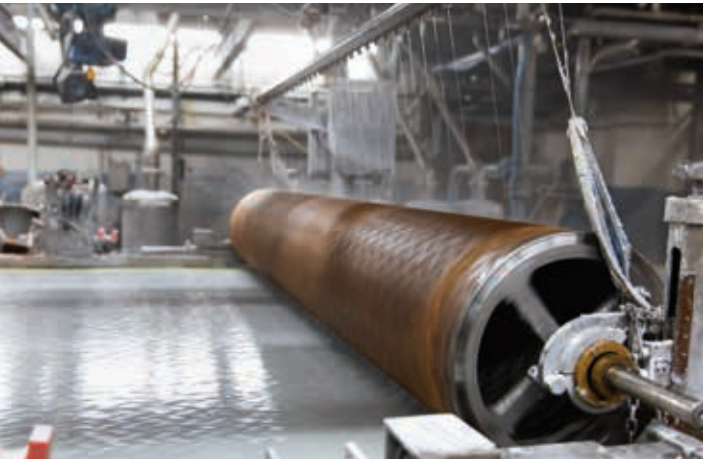
Watermarked paper is produced with the help of so-called dandy