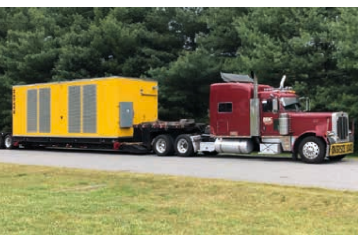
Units arrive on site completely assembled. Just connect to external power and pipe to the single outlet flange.