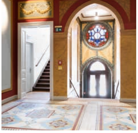
Irreparably damaged tiles were removed and replaced with new ones.