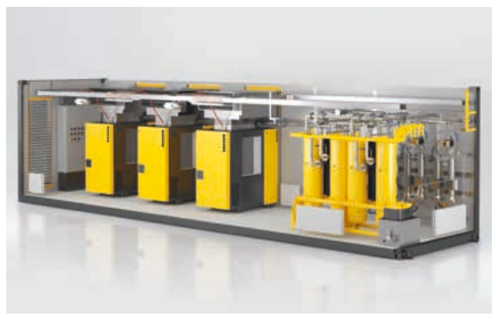
KAESER design engineers provide 2D and 3D CAD drawings to facilitate planning.