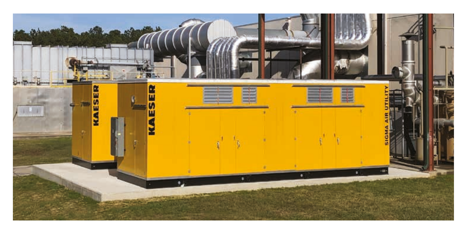
Enclosure based units are available in a variety of winterization levels and meet any ISO air quality level for maximum flexibility and placement.

Enclosure based units are available with different levels of weatherization and can meet any ISO Air Quality Class. These engineered air solutions also meet KAESER's rigorous "built for a lifetime" standards. Custom Engineered Solutions can be installed indoors or outdoors and can even be moved between job sites. Systems are designed to perform in the most demanding and challenging environments. "Putting compressed air equipment in a specially designed enclosure addresses the typical problems we face in a compressor room such as insufficient heating or cooling, undersized piping, electrical concerns, insufficient