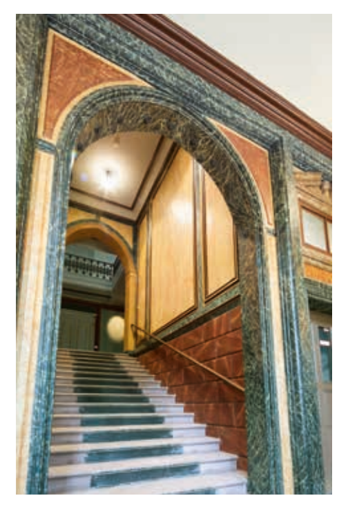
During the renovation, great care was taken to ensure that the historical fabric of the building was preserved.

The historical wooden and tiled floors were in very poor condition, but were brought back to life. This was no easy task because many tiles that were too badly damaged and needed to be replaced with new ones, but could not differ in shape or color from the existing ones. The wooden floor was renovated and partially renewed by a company specializing in such delicate and detailed work. The floors, the stucco ceilings, and the wall and ceiling murals were all in very poor condition throughout the building. Some stucco elements were even missing and had to be reconstructed by hand. The wall and ceiling murals, some of which had been painted over several times, were no longer visible, but were uncovered and restored to their former glory. The MOBILAIR