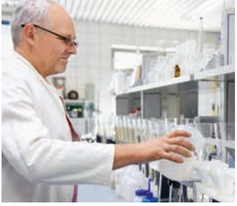
Water quality analyses are performed daily in the in-house laboratory.