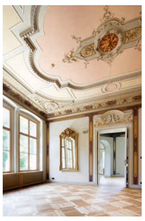
The stucco ceilings, as well as the wall and ceiling murals, had to be exposed and restored throughout the residence.

The historic windows and doors were reconstructed, renovated, color-matched and reinstalled by a company specializing in historic preservation. With a compact footprint of only six square feet and combining all of the components necessary for quality compressed air supply (namely a SIGMA Profile rotary screw compressor, a refrigerated dryer and a compressed air receiver), turnkey all-in-one SXC compressed air systems were the ideal choice for this work, which was carried out in a special onsite workshop. The greatest challenge was the