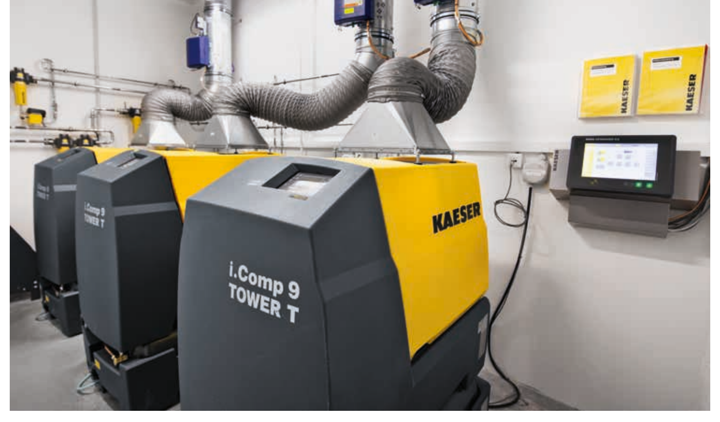
Three KAESER i.Comp 9 Tower packages ensure the large laboratory never goes without compressed air.

requirement is a true speciality of KAESER's i.Comp-Tower series reciprocating compressors. Featuring a variable speed motor, these oil-free reciprocating compressors are exceptionally compact and deliver the precise amount of compressed air that is actually needed at all times. The compressor block, air receiver, refrigerated dryer and the integrated SIGMA CONTROL 2 controller are all housed within a single turnkey unit. In addition, activated carbon adsorbers, various prefilters, pollen filters and a host of other available filters ensure compliance with the strictest of quality requirements.