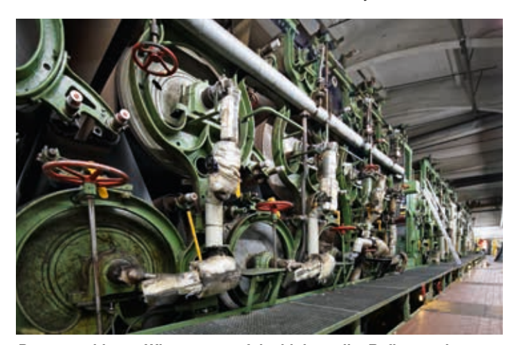
Paper machine 4: Where many of the high-quality Reflex products are made.

The new compressed air system entered operation in 2019. "Commissioning was quick, clean and professional," praised Christian Parreidt. The current consumption figures clearly show that all expectations with regards to cost efficiency have been met. With consistent production output, energy consumption fell from approximately 1 million kWh in 2019 by 20% to approximately 800,000 kWh. Christian Parreidt is pleased that costly production downtimes are a thing of the past and that the compressed air required for the plant's various processes is available in the expected quality and with maximum reliability.