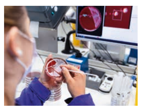
At Bioscientia Ingelheim, a total of around 25,000 samples are processed every day, 80% of which are completed the same day.