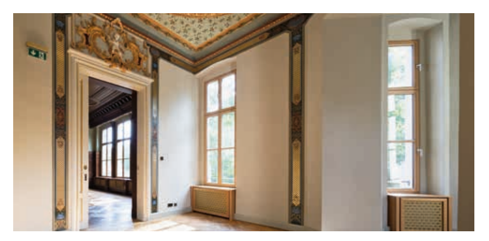
The wooden floor was renovated and partially replaced by a specialty company.

The renovation and repair work on the Schloss Ketschendorf summer palace in Coburg spanned five years (2015 - 2020) and the results are impressive. There is no question the original goal of transforming the once dilapidated residence into a sparkling jewel has been achieved, and today the historical backdrop offers a more than fitting stage for a wide variety of events for KAESER customers and employees alike.