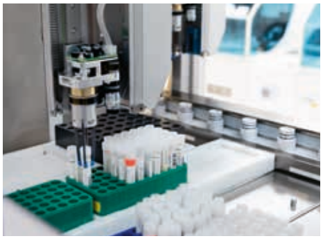
...and here with the sample tubes.