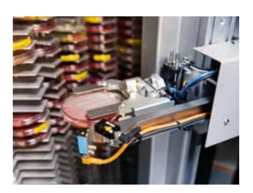
The compressed air performs a wide range of tasks in the large laboratory. Here with automatic handling of the Petri dishes...

9-Tower-T packages were procured, two of which always operate at the same time and whose interaction is monitored and controlled by a SIGMA AIR MANAGER 4.0 master controller, while the 3rd i.Comp-9-Tower-T provides redundancy. Furthermore, the compressors operate alternately so they all have the same operating hours. meaning maintenance work can be planned for the same time and be performed in one go. To be on the safe side with regard to the power supply, the compressors are connected to two separate electrical circuits (normal power and emergency power). Therefore, everything has been done from a technical perspective to ensure smooth and uninterrupted sample processing not only for today, but also for the future.