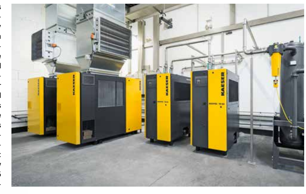
The compressed air supply meets the stringent requirements of Quality Class 1.4.1 in accordance with DIN ISO 8573-1.

cisive factor ensuring full compliance with Quality Class 1.4.1: the