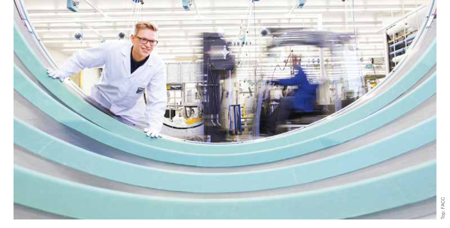
Maximum flexibility: the lightweight construction of the engine nacelles permits ideal streamlining of the engine in line with aerodynamic conditions.

master controller with adaptive 3D pressure control. Among other functions, it ensures that the pressure never drops below the lowest permitted operating pressure as detected at the pressure sensor measurement location.