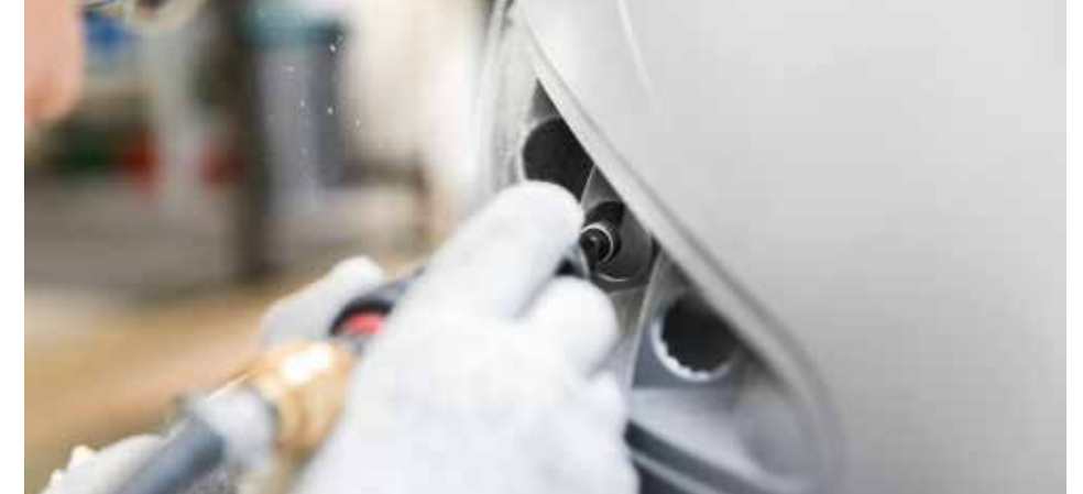
Compressed air is used to power almost every production stage.