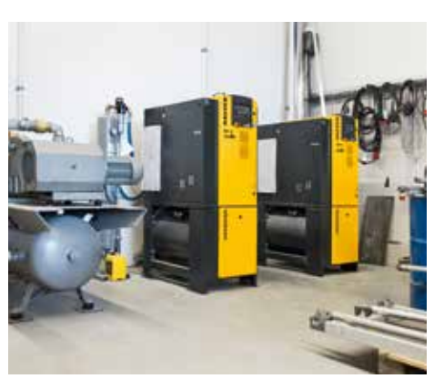
The KAESER station provides the necessary supply of compressed air.

Four years ago, the system needed to be expanded once again since compressed air was also needed on-site for the assembly line in the plastics processing department located across the road. Two more SM 12 AIRCENTERs were installed for this purpose. A wise decision as the system now runs "smoothly and to our complete satisfaction," according to René Stecher.