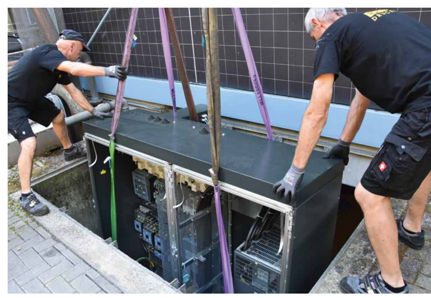
The body of the compressor unit had to be guided carefully through the light shaft.

exposed steel skeleton – an unequivocally modernist design. The building in which the laboratories are currently accommodated is now a listed architectural heritage site.