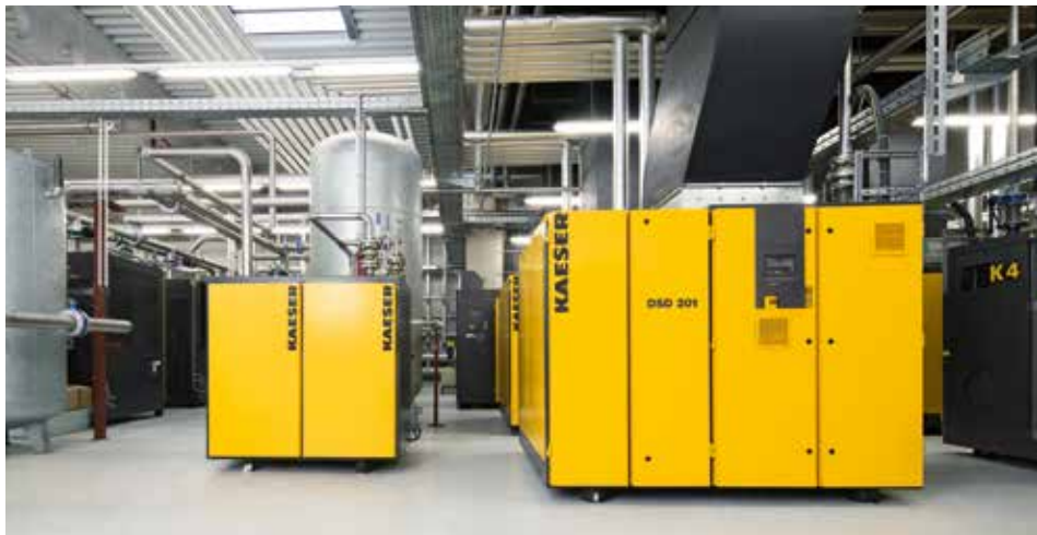
The SIGMA AIR MANAGER 4.0 master controller with adaptive 3D pressure control allows the individual compressors to be switched on and off as conditions require.