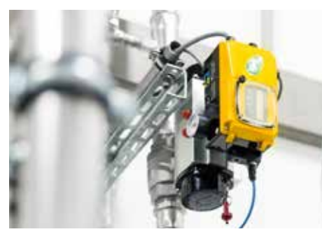
The air-main charging system prevents overloading the system and contamination of the compressed air network when the system is restarted.