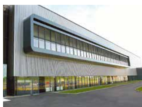
FACC manufactures engine components using lightweight construction techniques here in Reichersberg.

The core competency of FACC is developing and manufacturing carbon composite