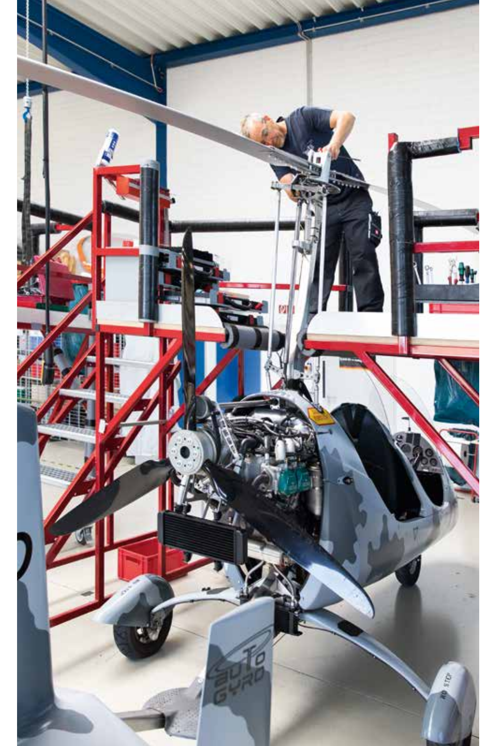
Approximately 90% of the components are manufactured on-site.