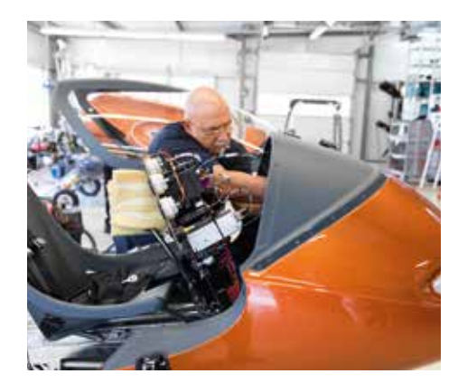
Final cockpit assembly: installation and connection of the aircraft's avionics equipment.

Thanks to its design, the gyrocopter flies with very special and unique characte-