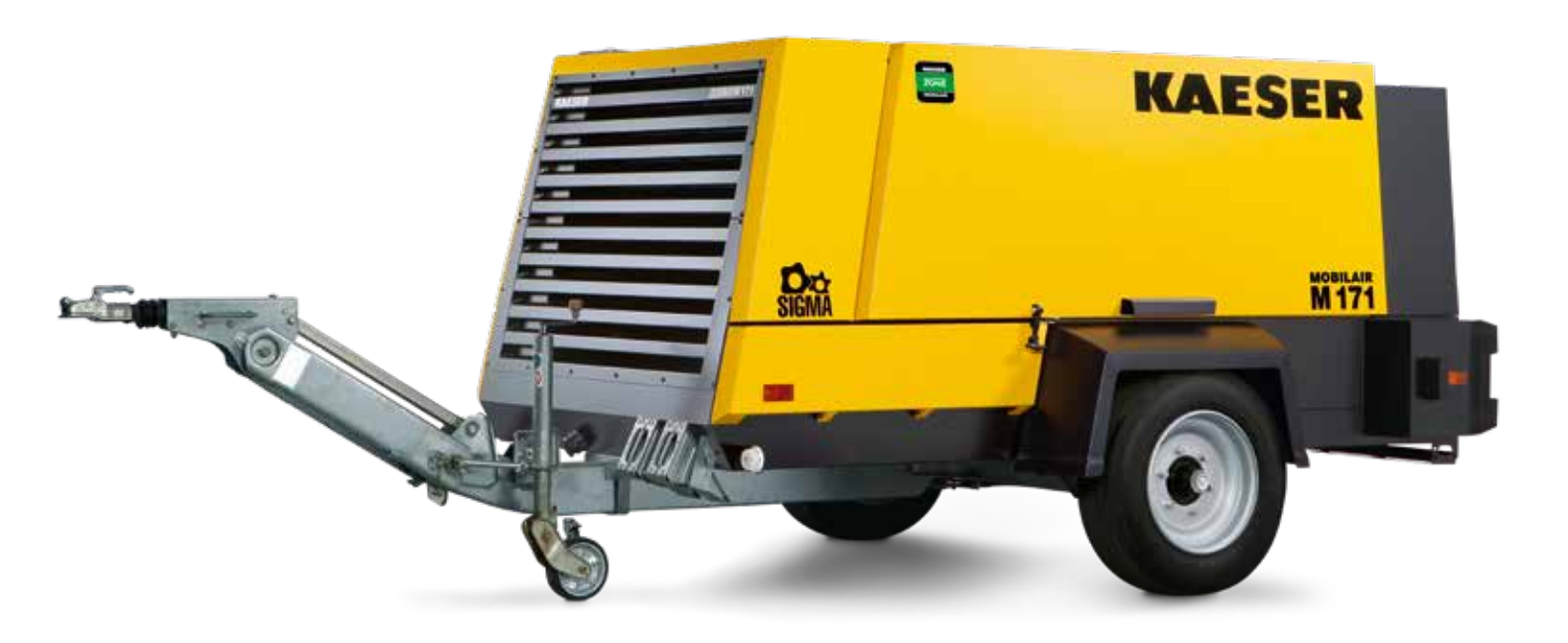
Designed to be user friendly on-site and during transport.

The M171 also features an advanced energy-saving fan that is controlled according to operating temperature, and results in fuel savings of up to 6 percent. Users looking for efficiency, flexible pressure options and user-friendliness will find that the M171 hits the mark