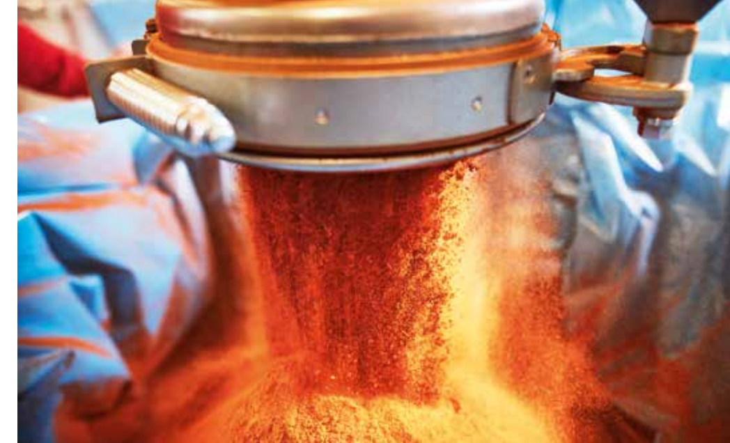
The Fuchs Group – cultivating a world of good taste