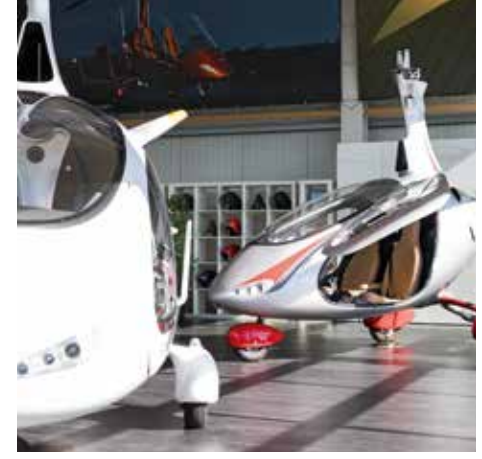
The gyroplane before the rotor is fitted.

ristics, making it one of the safest aircraft of all. Unlike fixed-wing aircraft, there is no danger of stalling or tailspin. Even in the event of engine failure, the Autogyro retains full control capability and merely loses altitude slowly as it is still able to perform a controlled landing. Almost like no other rotorcraft, the Autogyro can even be flown in strong winds and can be used practically all year round. As extreme low speed is possible, the gyroplane is ideal for excursions and day trips. Moreover, the sky's the limit when it comes to the design. It can be customized in any way, from a company logo to a family coat of arms or a distinctive color coating.