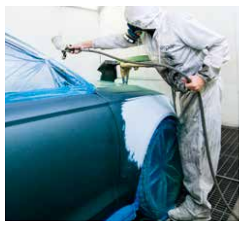
...and the spray paint booth.