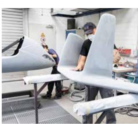
The tail units are also produced in the factory at Hildesheim Airfield.

the Red Dot Design Award in 2012. Last year, the exceptional design of the sleek planes received yet another accolade. The "MTOsport" won the coveted "Best of the Best" 2018 Red Dot Design Award, which officially attested to the ultra-light aircraft's "innovative symbiosis of aesthetics and function".