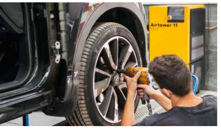
Powering the air impact wrench...