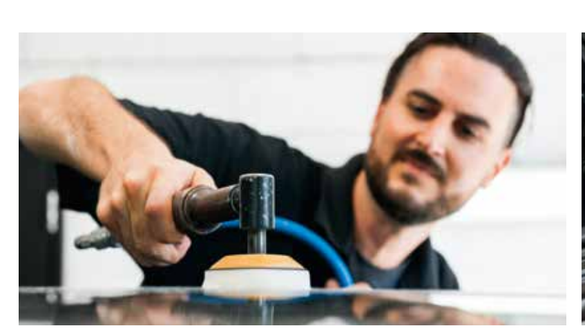
Compressed air is indispensable in powering the tools used in the car repair

Without compressed air, the repair shop grinds to a halt.