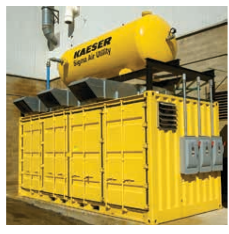
A _ hp weatherized simplex system.

"Kaeser's Sigma Air Utility solution ensures we always have compressed air with lower total costs while retaining working capital. We use the Sigma Air Utility at several plants, and the end results have always met or exceeded our expectations. We continue to roll this program out to more facilities."