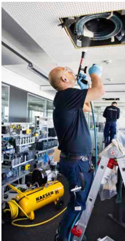
Left: The 'Eisschmitt Truck' transports the MOBILAIR compressor and all necessary dry ice blasting equipment.