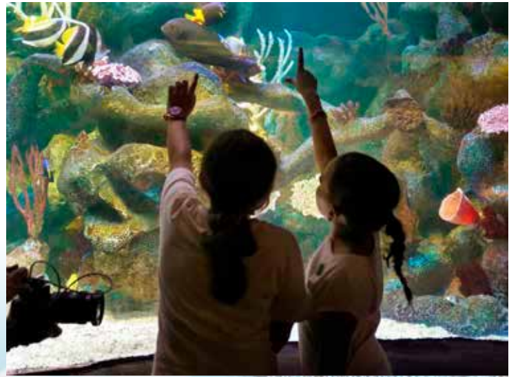
Image above: The TEMAIKÈN Biopark protects, among other things, endangered animal and plant species.