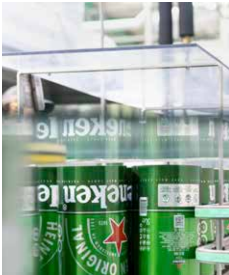
The iconic party keg remains a favorite among consumers worldwide.