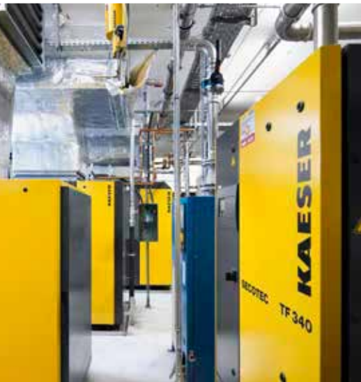
The new expanded compressed air station is designed to meet higher future demand.

now 568,556 kWh – around 88,000 kWh less than in the comparison period. This equates to annual savings of over €26,000 and a CO 2 reduction of roughly 41 metric tons. And it gets even better: since ENVASES uses heat recovery to support space heating and hot water production, an additional annual saving of almost €27,000 is achieved. In total, this brings yearly savings to over €53,000. Jan Massa is thorough-