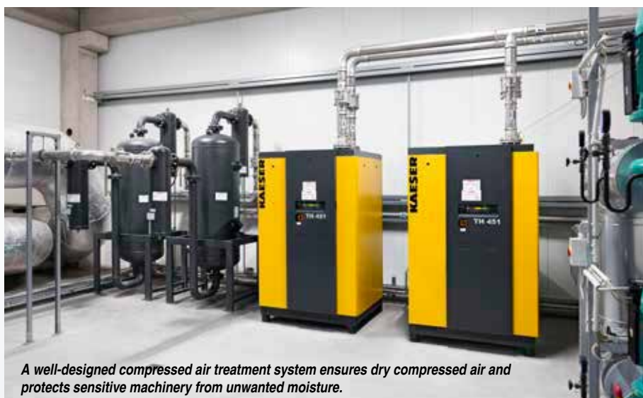
A well-designed compressed air treatment system ensures dry compressed air and protects sensitive machinery from unwanted moisture.

Thanks to modernization of the compressed air station, Geberit has achieved energy and cost savings of 45 percent compared to the previous system. Oliver Werner is especially proud of the reduction in CO 2 emissions, which have been reduced by over 380 metric tons per year: "That's a significant achievement for our company, since sustainability is one of our core priorities."