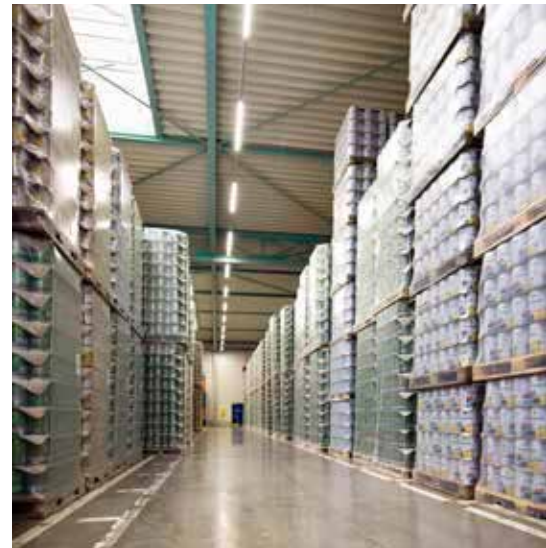
ENVASES supplies its products to leading German and international breweries.

sidering how to modernize and expand the compressed air station. The issue became more urgent when an older compressor from another manufacturer failed and needed replacing. ENVASES had already had excellent experiences with KAESER systems at both Plant 1 and 2. Over the years,