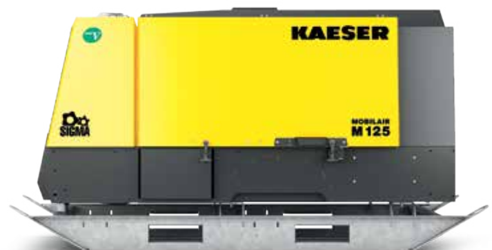
Image right: MOBILAIR portable compressors are well equipped for demanding, continuous use on construction sites, even under harsh climatic conditions.

Image left: The payload capacity of the transport helicopter had to be taken into account when selecting the compressors.