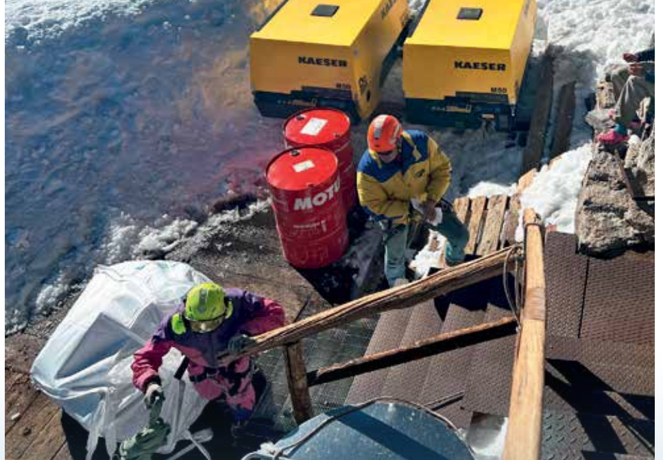
Working at this elevation poses a significant challenge for both the scientists and the equipment.

the necessary compressed air to operate the instruments and monitor the various environmental parameters, enabling us to properly conduct all activities related to the project's measurement objectives.