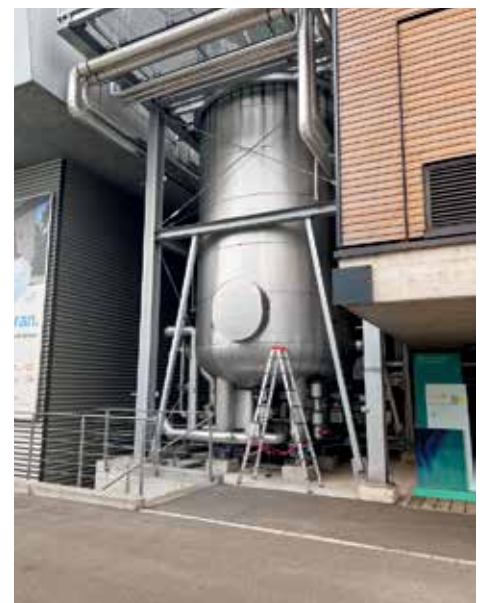
The heart of the power-to-gas plant: the bioreactor.

These highly versatile compressors provide the control air for the valves in the power-to-gas plant. In January 2023, the Swiss Federal Office of Energy (SFOE) awarded the Watt d'Or for the 16 th time. For establishing the first industrial power-to-gas plant, Limeco and its partners received the prestigious Swiss Energy Award in the "Energy Technologies" category.