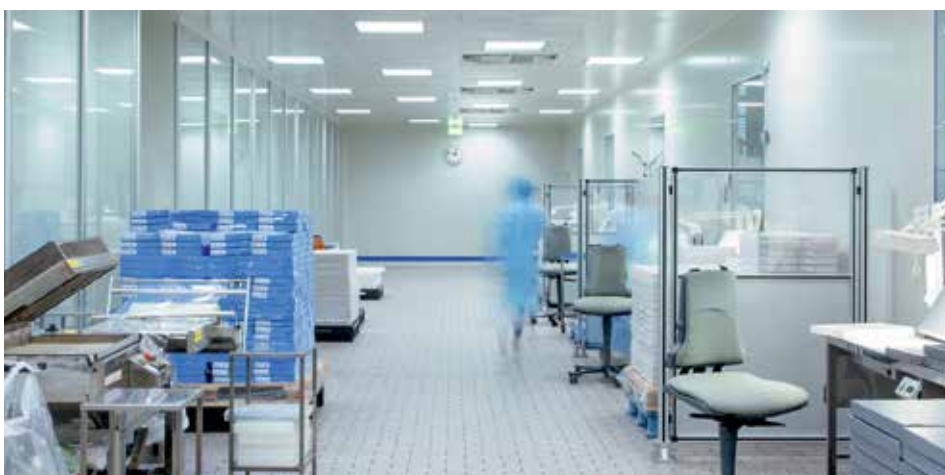
For specialized products, Müller + Müller provides a unique silicone coating process for its glass vials, in which compressed air plays a crucial role.