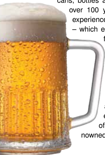
Image right: Pneumatically controlled valves are an essential part of the operations at Tribe Breweries.

Image left: Central compressed air station in the brewery.