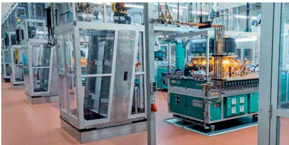
Müller + Müller offers a wide range of glass vials, which are produced on a total of 50 state-of-the-art production lines.