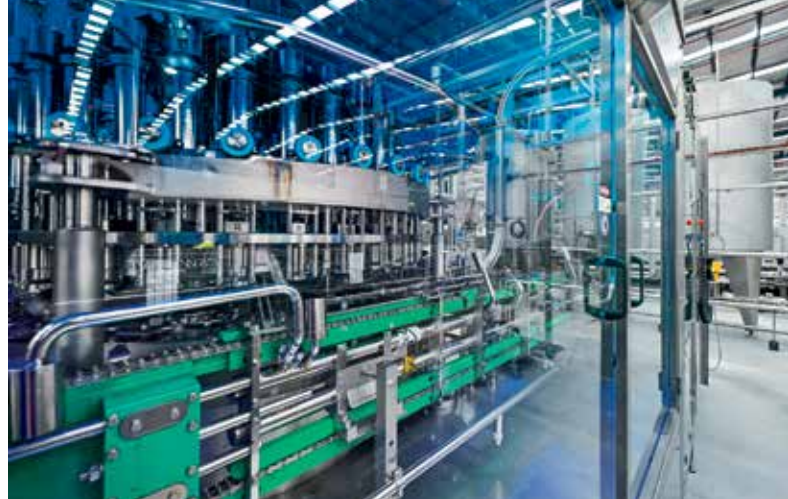
Image left: Tribe Breweries produces many different beer brands. Image right: Compressed air also plays an important role in the brewing process.

meant that production capacity needed to be expanded and with it the compressed air supply. Therefore, in recent years the compressed air station was expanded to the tune of an additional CSG 55 compressor and a second SECOTEC refrigeration dryer plus further KAESER Filter products; these were