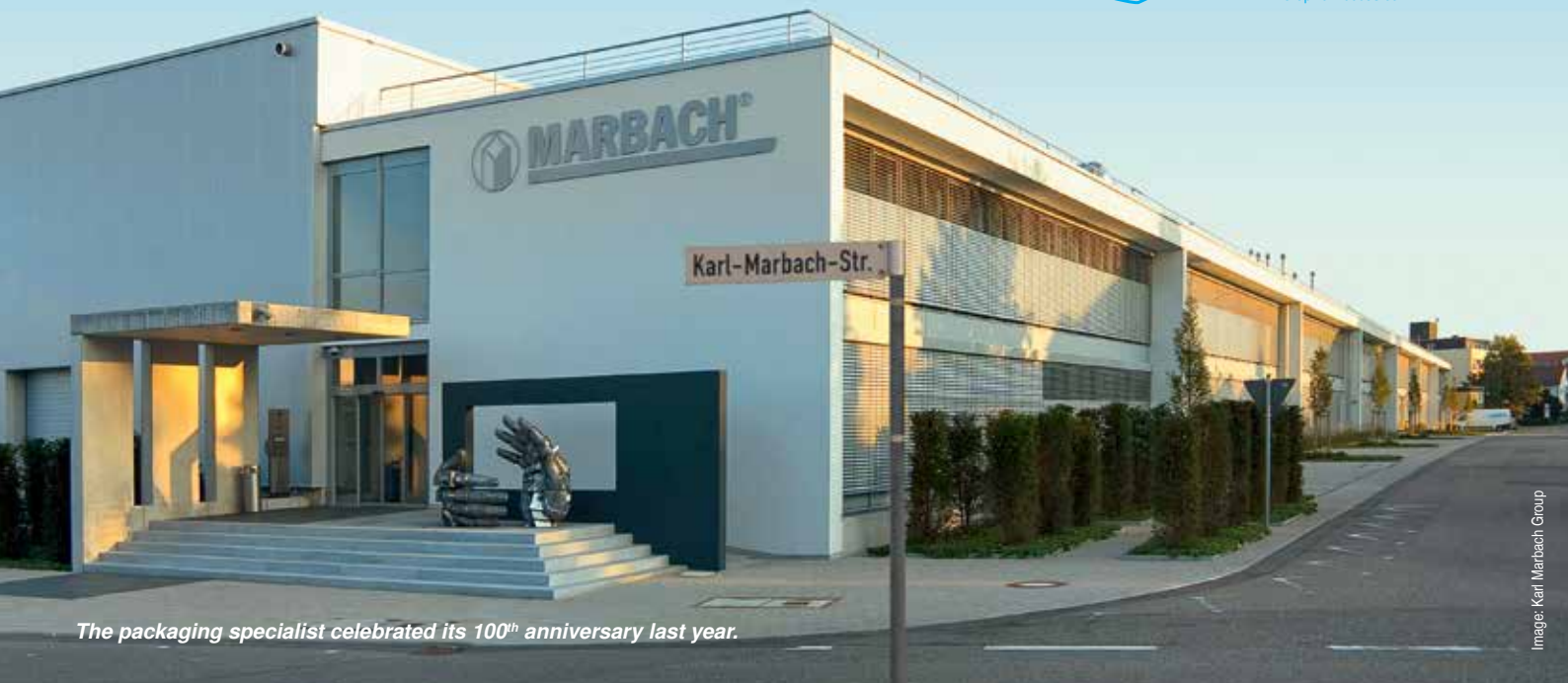
The packaging specialist celebrated its 100 th anniversary last year.