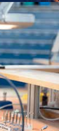
Technical equipment. workstation.